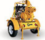
NPD-6TDE View Features