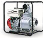
NPH-4 View Features