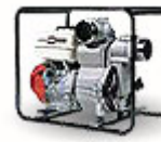
NPH-4T View Features