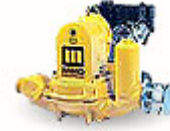
N-300H View Features