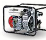
NPH-2T View Features