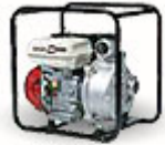
NPH-2 View Features