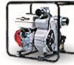
NPH-3T View Features