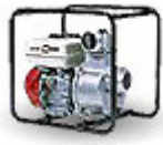
NPH-3 View Features